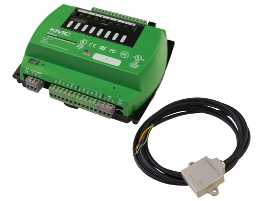
A BAC-5901C-AFMS (controller with inclinometer) is a core component of the AFMS.