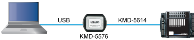
Illustration 2 Connecting directly to a controller