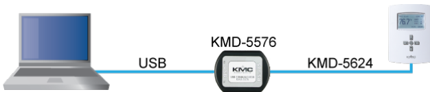
Illustration 3 Connecting to a FlexStat or Appstat