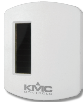
STW-6010 and THW-1102