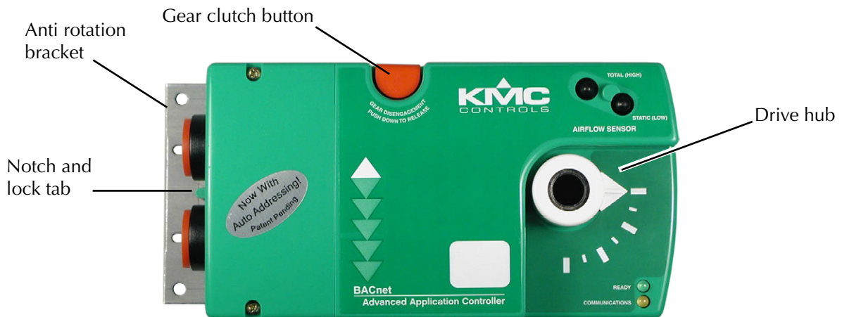
Illustration 1—Mounting the BAC-7000 VAV controllers